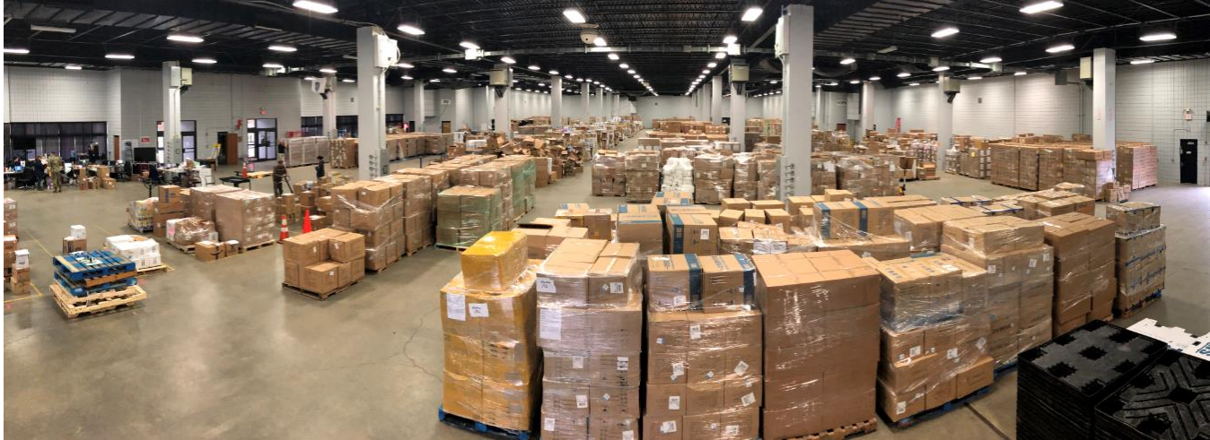
Snapshot of MEMA's Warehouse (posted to MEMA's Facebook page 4/24)

To date, the Department of Public Health (DPH) and the Massachusetts Emergency Management Agency (MEMA) have supplied over 5.6 Million pieces of Personal Protective Equipment (PPE) to hospitals, first responders, nursing homes, state agencies and others through a massive logistics effort and assistance from the Massachusetts National Guard.